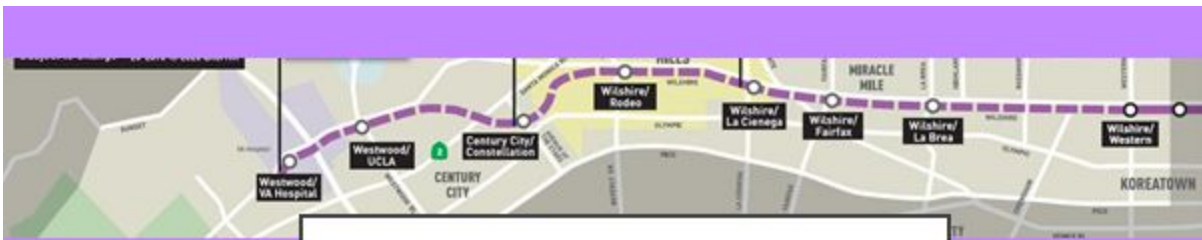
PURPLE LINE EXTENSION

The Westwood/VA Hospital station, final stop on the Purple Line Extension, is scheduled to open in 2027. The line will connect Brentwood to Downtown LA and points in between.